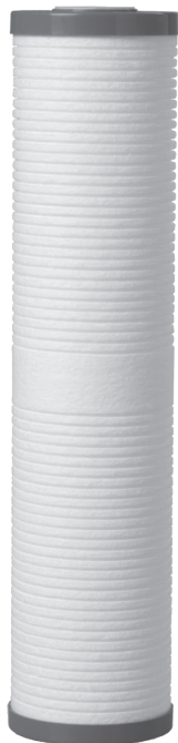
AP810-2 / AP811-2