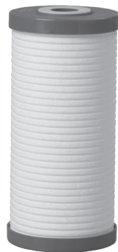
AP810 / AP811